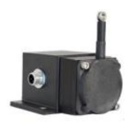
Figure 4: String Potentiometer