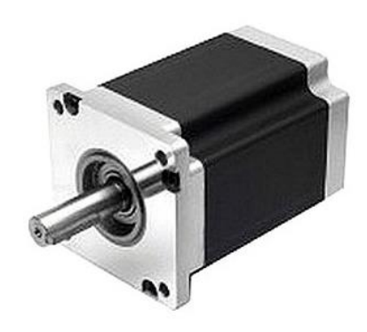
Figure 4: Stepper Motor