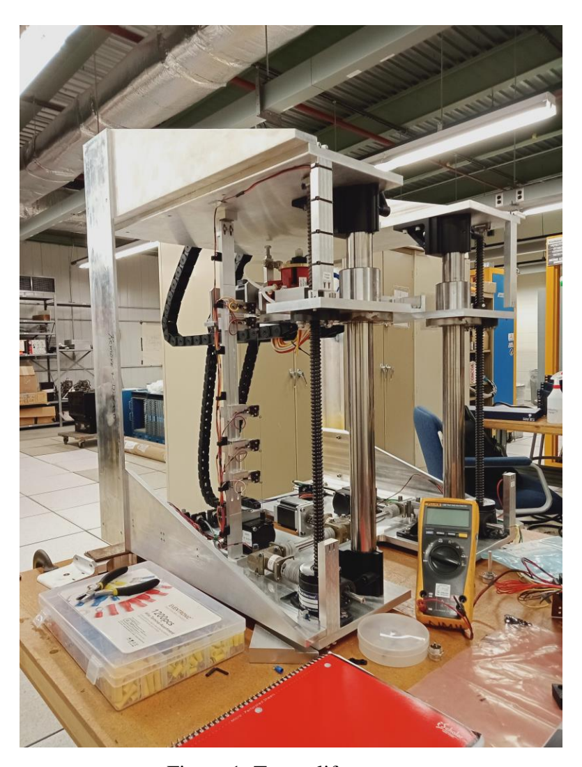
Figure 1: Target lifter system

The main objective of the target lifter system is to position the target cups of the target stick aligning with the beamline. The movement of the actuator is produced by a stepper motor with a gear system. The motion of the stepper motor is controlled by a computer applet built on LabView. The real-time position of the actuator is determined using two string potentiometers and seven position switches. The voltages of the two potentiometers are captured by a 16-bit Analog to digital converter and the position switches are connected with the I/O pins of the motor controller. Figure 1 shows the target lifter system.